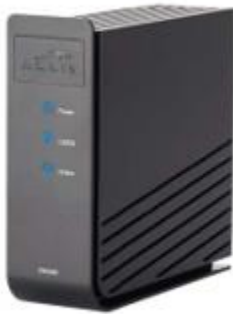
Arris CATV Modem